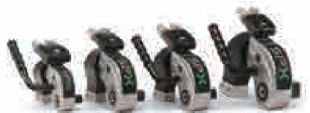
To be used with torque wrenches, pages 10-31